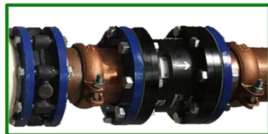
6" Smart Valve Installed at Houston Hospital

How it Works: The valve modulates the speed of the pressure drop in the water as the clay valve opens and fills the domestic house tank. The meter's cavitation is much less with the Smart Valve - and that means less, to almost no, air is being read as water.